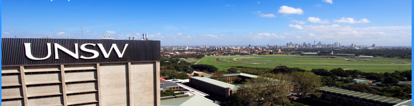
The view of Sydney across Randwick Racecourse