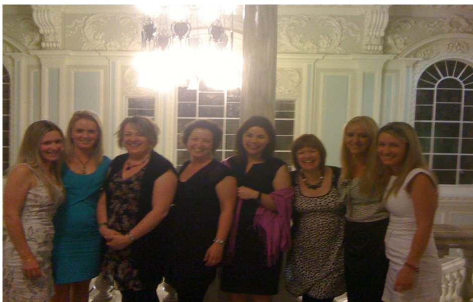
Table 5 at SSM City Hall Dinner, 7th September 2010

We were also delighted with the very positive feedback provided by some of the recipients of SSM Free Student Places. The friendly and welcoming atmosphere for new researchers featured prominently: as one student said "As an inexperienced presenter myself, I could see myself feeling comfortable enough in the conference environment to present my work, and hope to do so next year". Other students also commented that attending this year's conference had inspired them to come back and/or get more involved in social medicine. For example, one student said: